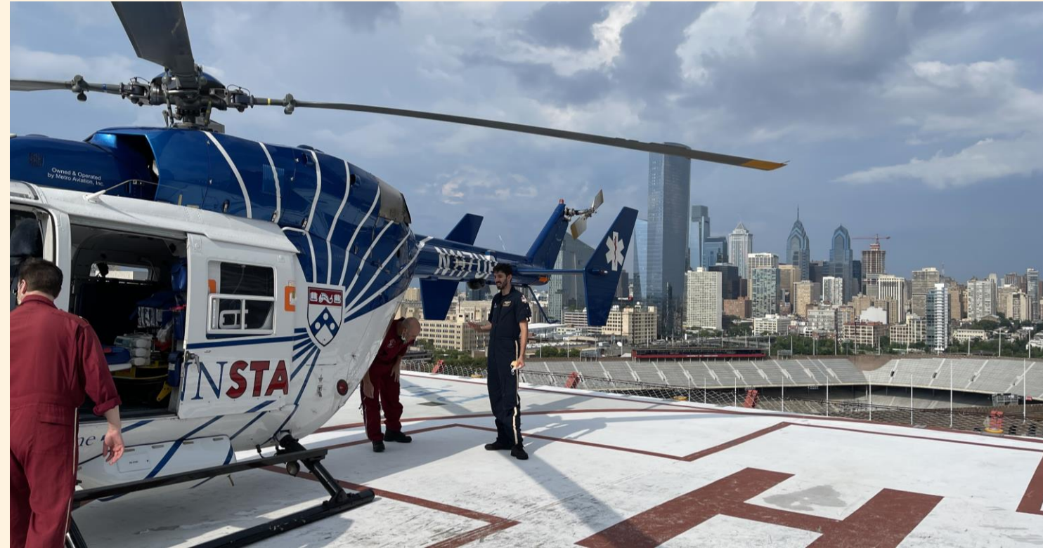
Rotary Wing Transport