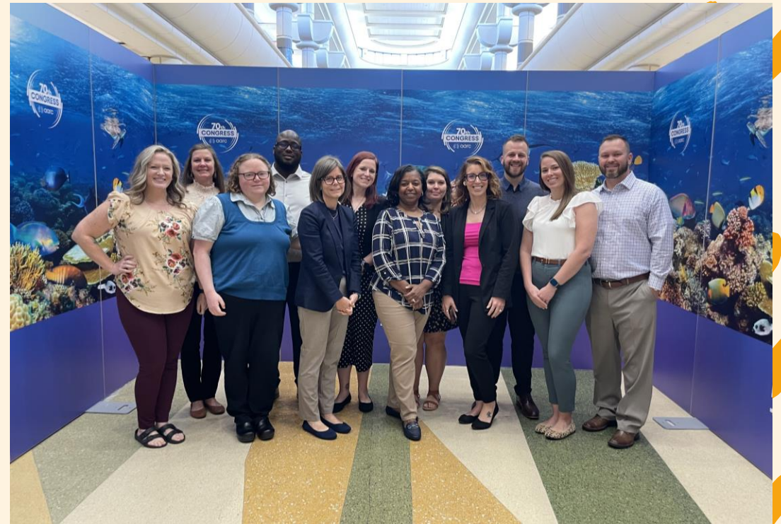
AARC 2024 - Orlando